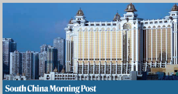
South China Morning Post